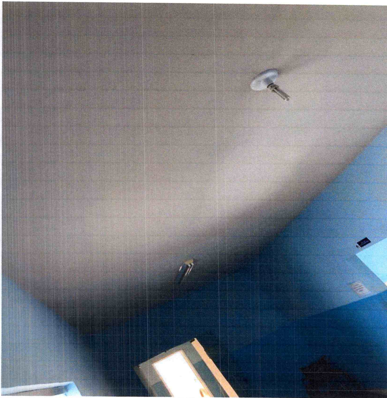
REVESTIMENTO PINTURA PAREDE E TETO